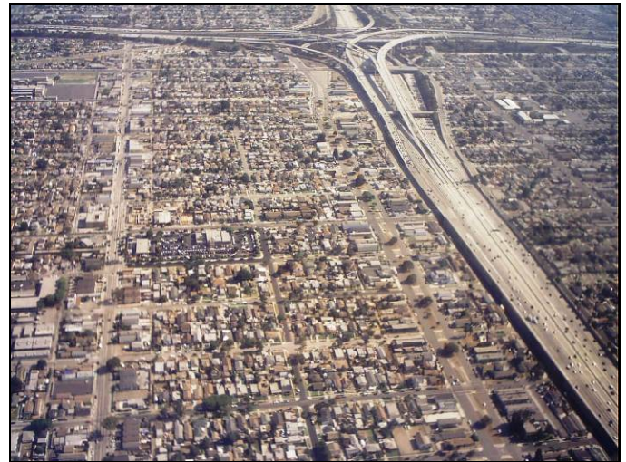
A large metropolitan city, perhaps one of the least diverse ecosystems on earth

Economy-wise, we are all witness to an ever-increasing gap between rich and poor, which put differently, is an increasing concentration of sources of investment capital. Simply put, there are fewer and fewer people making decisions about where to invest wealth and for what specific purposes. From a common sense standpoint, this does not bode well, and it should give one pause, to say the least.