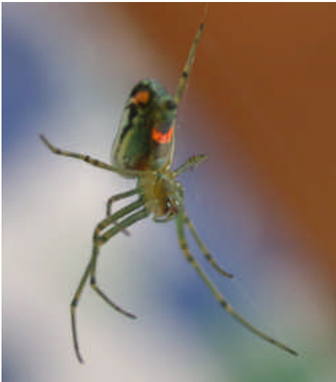
Orb weaver, Leucauge sp., from below

Spiders Photo inventory - We have initiated a spider photo inventory project. Although photography of spiders will not enable complete identification without the preservation of archival specimens, digital photos provide a preliminary record of our present spider population. Spiders comprise a large and very varied family in the tropics. The number of species in the Neotropics is undetermined, but is suspected to be very large. The majority of the Latin American spider species are probably still unknown.