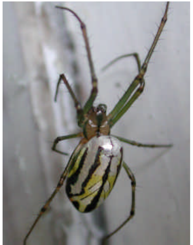
Same orb weaver, from above (0.8 cm)